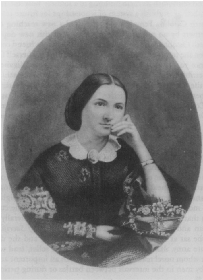
Augusta Jane Evans, author of Macaria; or, Altars of Sacrifice.

giving her father and her beloved beau Russell up to die on the battlefield and dedicating herself to the highest possible existence, laboring in “God’s great vineyard.” Married women, she admits, may be happier, but life was not made for happiness. It is the blessing—and macaria also means blessing in Greek—of the single woman to be more useful “because she belongs exclusively to no one, her heart expands to all her suffering fellow creatures.” For Irene, sacrifice becomes a vocation, not unlike that of the nun. And, indeed, Evans describes Irene abandoning fashionable garments for robes of black or white, tied at the waist by a tassel, suggesting that the analogy with the female religious is entirely self-conscious—for Evans as well as Irene. To her childhood friend, similarly bereaved by war, Irene declares, very much in the language of prevailing Confederate ideology,