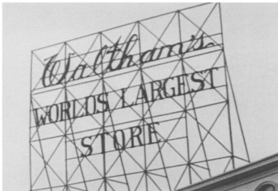
Figure 1. The opening shot of It invokes the film's consumer-driven narrative by referencing both the store where Betty Lou (Clara Bow) works as a salesgirl and the man, Cyrus Waltham (Antonio Moreno), whom she will eventually acquire. Paramount Pictures, 1927.

and with her decidedly sexualized and empowered modes of seeing and being. The film celebrates its female star's rebellion against traditional modes of passivity and complicates her relationship to the process of objectification. In other words, It seems every bit as much made for the male gaze as for its often neglected female counterpart.