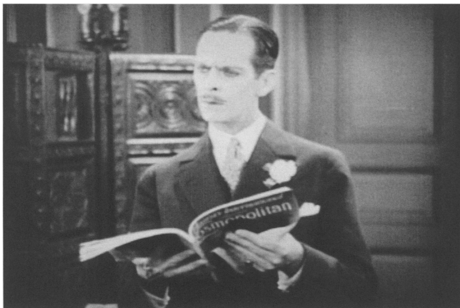
Figure 4. After reading Elinor Glyn's piece on "It" in Cosmopolitan , Cyrus Waltham's associate Monty (William Austin) detects "It" in Betty Lou. This is one of several moments in It that suggests the degree to which print culture mediates desire. Paramount Pictures, 1927.

of the New Woman: desiring to near animalistic proportions. While restraint is partly lost in silent film because of the need for a compensatory acting style, extreme gestures, and the exteriorization of desire, Betty Lou's hyperbolic desire is isolated and unique, leading us to wonder about her particular lack of decorum and passivity, attributes that have historically been associated with proper women's behavior, particularly in the public sphere.