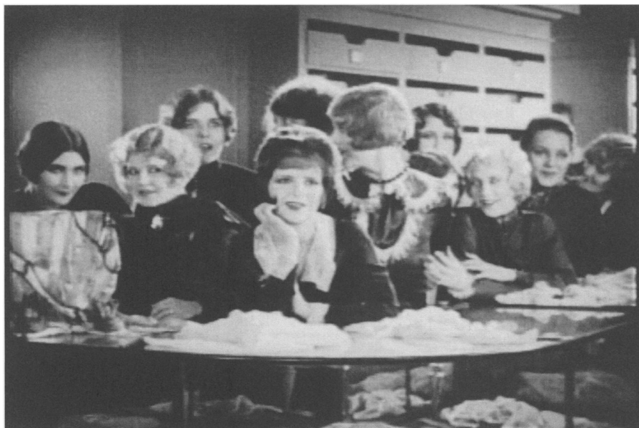
Figure 3. Betty Lou and the other salesgirls in It take a moment to unabashedly enjoy looking at their new boss, Cyrus Waltham, thereby reversing the traditional economy of gazes. Paramount Pictures, 1927.

The press kit perpetuates the idea of women as the object of the gaze and suggests that whatever reversals might take place in the film, entrenched standards of representation remain unchanged. Removed from its cinematic context, the image of a group of men staring at Clara Bow seems perfectly natural in the context of her career. In fact, the press kit image says more about Clara Bow as a star than about Betty Lou as a character, for Bow's career was utterly reliant on marketing her sexualized, visual appeal. While Betty Lou as a character initiates this scopic inversion only to reverse it by fighting her way into Waltham's visual register, Clara Bow the actress seemed hard-pressed to exist outside the intense visual scrutiny of the public and the studios. This is, no doubt, why Bow later in her life removed herself to the Nevada desert, where she could gain the kind of anonymity that would have impeded the spectacular nature of Betty Lou's romantic conquest.