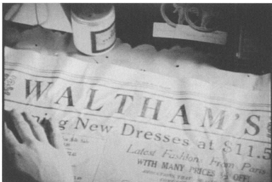
Figure 6. While Betty Lou makes a homemade dress for her night out at the Ritz in It , she spies an advertisement that reminds her of both the material things she lacks and the man who embodies those things. Paramount Pictures, 1927.

That class and desire are united in Betty Lou's lack is further evidenced when she and Monty arrive at the Ritz. The mâitre d' sizes up Betty Lou—as do we, aligned as we are here with the camera's perusal of her—and detects the flaws that belie her class. As she is led to a “quiet table,” Betty Lou scours the restaurant, looking for Waltham; her gaze is searching, predatory. When she spots him, she does a double take as we inhabit her point of view, and the shot rapidly dollies in to a close-up on his face. Her frantic desire is evident again in the dolly; ideologically, we are aligned with Betty Lou and her quest—both visual and literal—for Waltham. When Betty Lou drags Monty to a more centrally located table, again controlling the action of the scene in her attempt to direct Waltham's gaze, she finally gets what she has been working for when the two make eye contact. Of course, once Betty Lou has attracted Waltham's gaze, the rest is quick to follow.