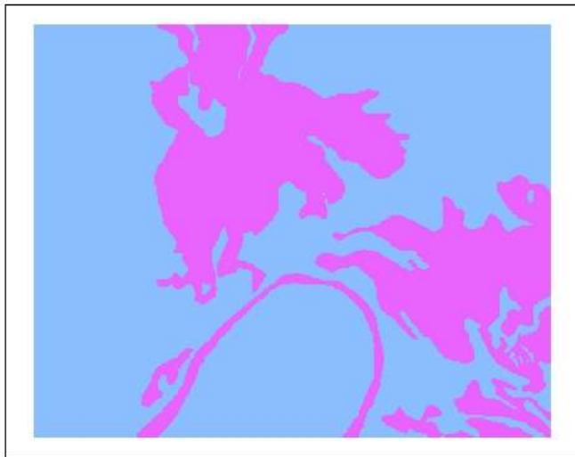
Flood or Clay