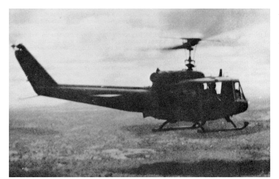
Huey UH-1D, the main troopcarrying helicopter, flying across the plateau country near Pleiku.