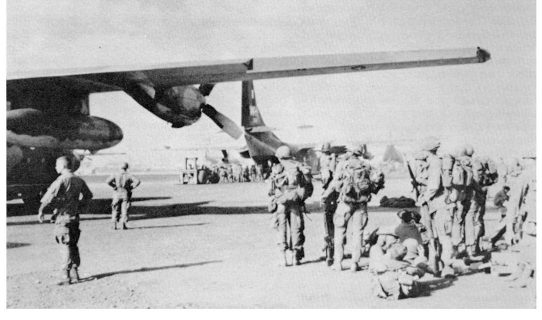
Author's unit waiting to board planes at the Ban Me Thuot Airport for a flight to Pleiku. Note the gear carried by the men.

That operation was unusual. My company normally maneuvered on its own, though not always as a unit. The three rifle platoons frequently were given separate assignments, enabling us to cover more territory. This part of our S.O.P. made sense, providing the platoons remained in supporting distance of each other. That didn't always happen. Long after I was wounded, my former platoon was ambushed; it fought for hours on its own, help being too far away, losing one-third of its men. Yet the reasons behind having the platoons operate individually (like those underlying the rest of our S.O.P.) were never clearly explained to us. The men I knew instinctively disliked the idea. True, they were aware that in theory units were never truly "alone," since they could summon help ranging from nearby outfits to air strikes. Furthermore, we were told that, if wounded, we would never be more than 20 minutes from a hospital.20 But variables - such as the weather, the number of friendly units in trouble, clamoring for aid — could affect these cal-